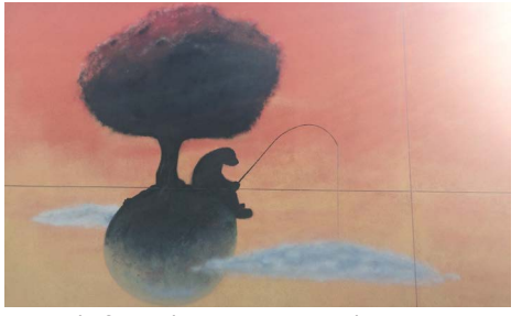
Detail of mural at Binswanger Glass Company