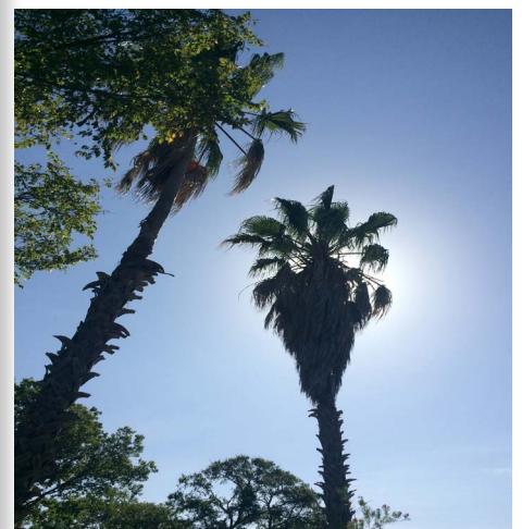
Palm trees on Frederick St.