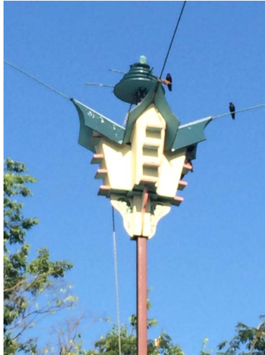
Birdhouse near Post Road

You can find more information at: https://austintexas.gov/asmp