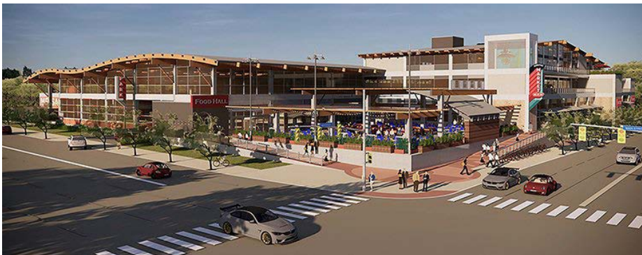
Rendering of proposed redesign of South Congress H-E-B store.

For more information: https://www.heb.com/static-page/south-congress-remodel