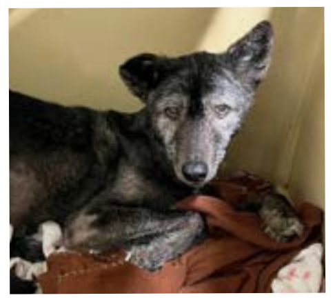
Coyote after rescue